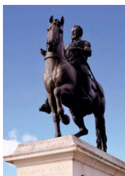
This equestrian statue of Henri IV is the landmark you are looking for if you are approaching rue Dauphine from the Île de la Cité

In 2000, the management of the luxurious Hôtel d'Aubusson decided to give a new vocation to their bar, Café Laurent, at 33 rue Dauphine, which a half century before had been Le Tabou. "At a time when the jazz