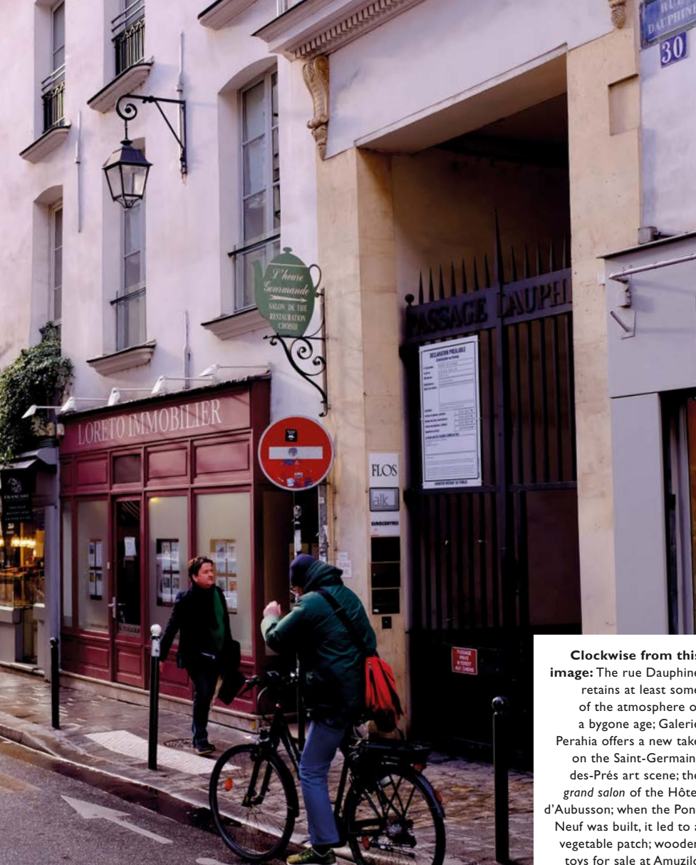
Clockwise from this image: The rue Dauphine retains at least some of the atmosphere of a bygone age; Galerie Perahia offers a new take on the Saint-Germain-des-Prés art scene; the grand salon of the Hôtel d’Aubusson; when the Pont Neuf was built, it led to a vegetable patch; wooden toys for sale at Amuzilo

Of course, rue Dauphine and Saint-Germain-des-Prés won’t ever stop evolving, but hopefully they’ll always preserve this colourful mix of the old and the new. That seems only fitting for a street overlooked by Pont Neuf – a bridge at once the oldest in Paris, yet also eternally new. FT