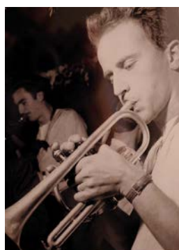
The days when Boris Vian played trumpet at Le Tabou are sadly long gone, but you can still hear live jazz at the Café Laurent, which stands at the same address

Over time, as the 6th arrondissement became one of the most fashionable, most expensive districts of Paris,